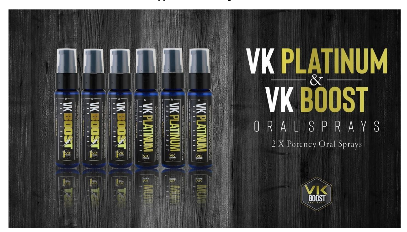
VK Platinum and VK Boost 2 X Immune System Optimizer Oral Sprays